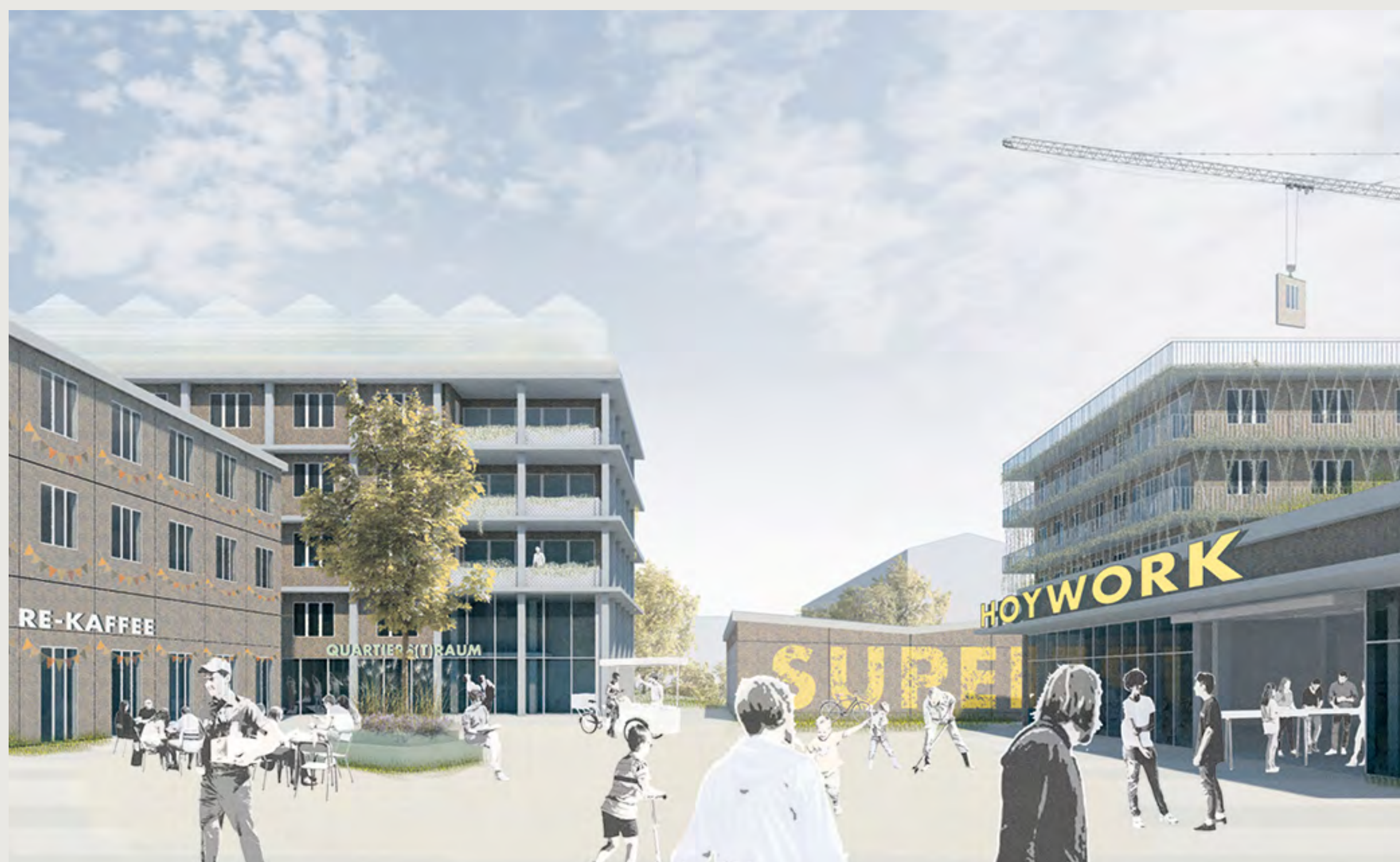
Perspective: Urban Hub as a Common