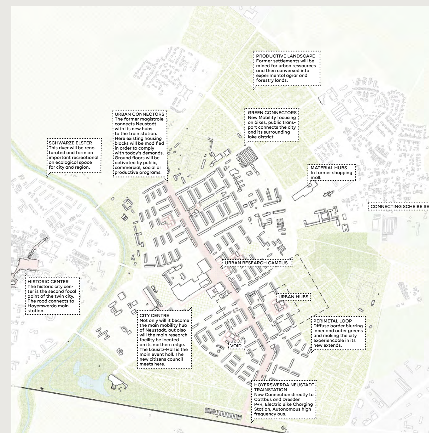
Masterplan Hoyerswerda Neustadt